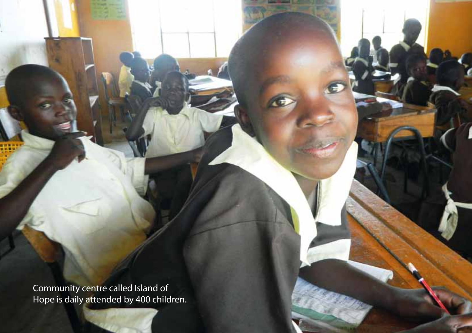
Community centre called Island of Hope is daily attended by 400 children.